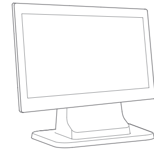
15.6" Touch Screen (L3551)