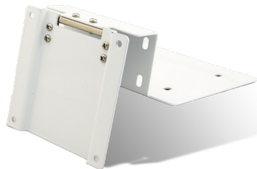
VESA Magnetic Shelf Stand