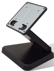
Foldable Desktop Stand