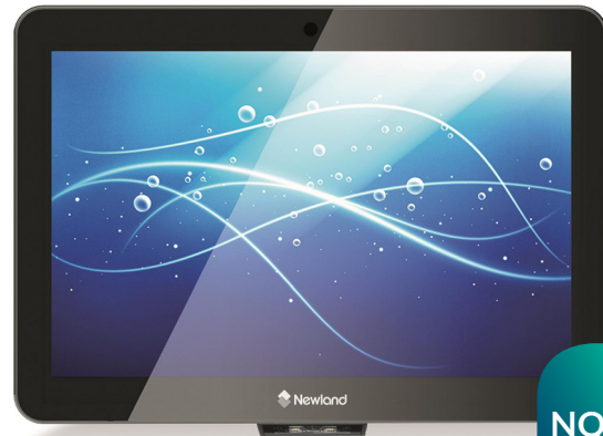
NQire 1000 Manta II micro kiosk